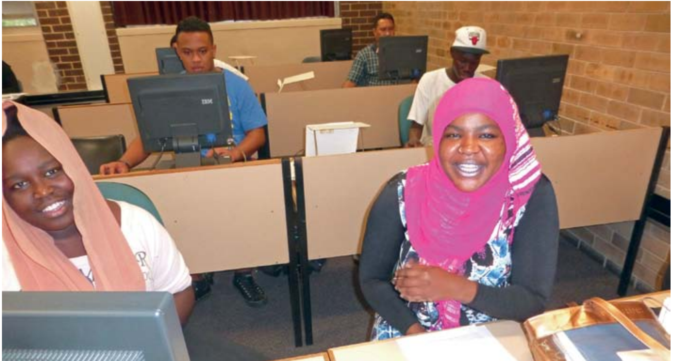
Participants in SydWest's Get Back on Your Feet project, learning computer skills.