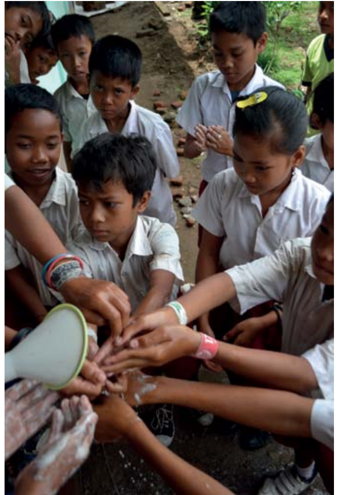
Children in Lombok learning about the benefits of handwashing as part of the Live and Learn project

The Hon Richard Marles MP Minister for Trade