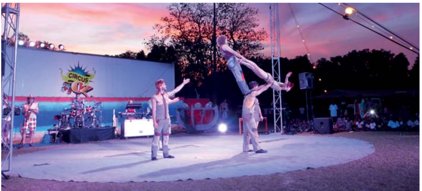
Circus Oz , Arnhem Land Tour