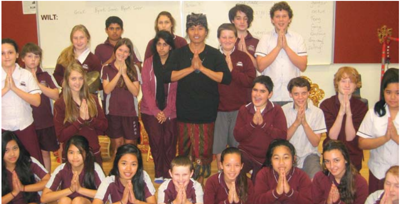
Students from Browns Plains State High School participating in the Indonesian Teacher's Network project