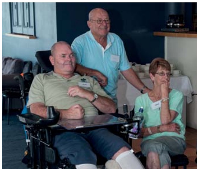
A participant in Summer Foundation's Regional Stories project at a Tell Your Story workshop, with his parents.