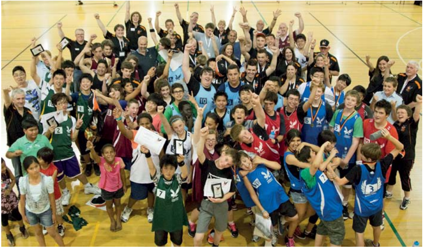
Midnight Basketball Marion Community Program awards night