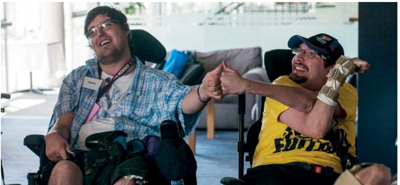
Participants in Summer Foundation's Regional Stories workshop giving each other a 'high five'