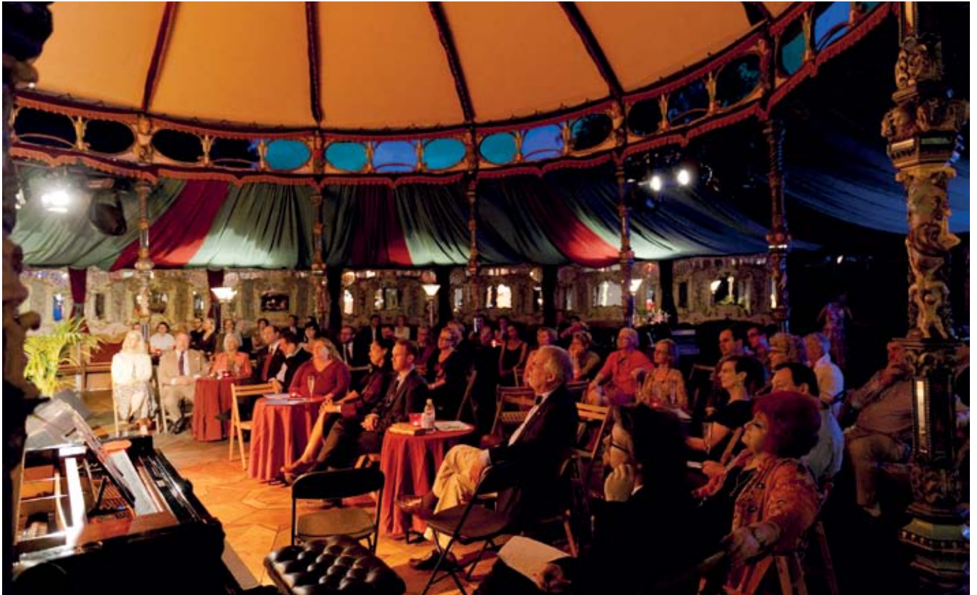
Above: Ceremony guests in the Idolize Spiegel tent, Senate Rose Gardens, Canberra