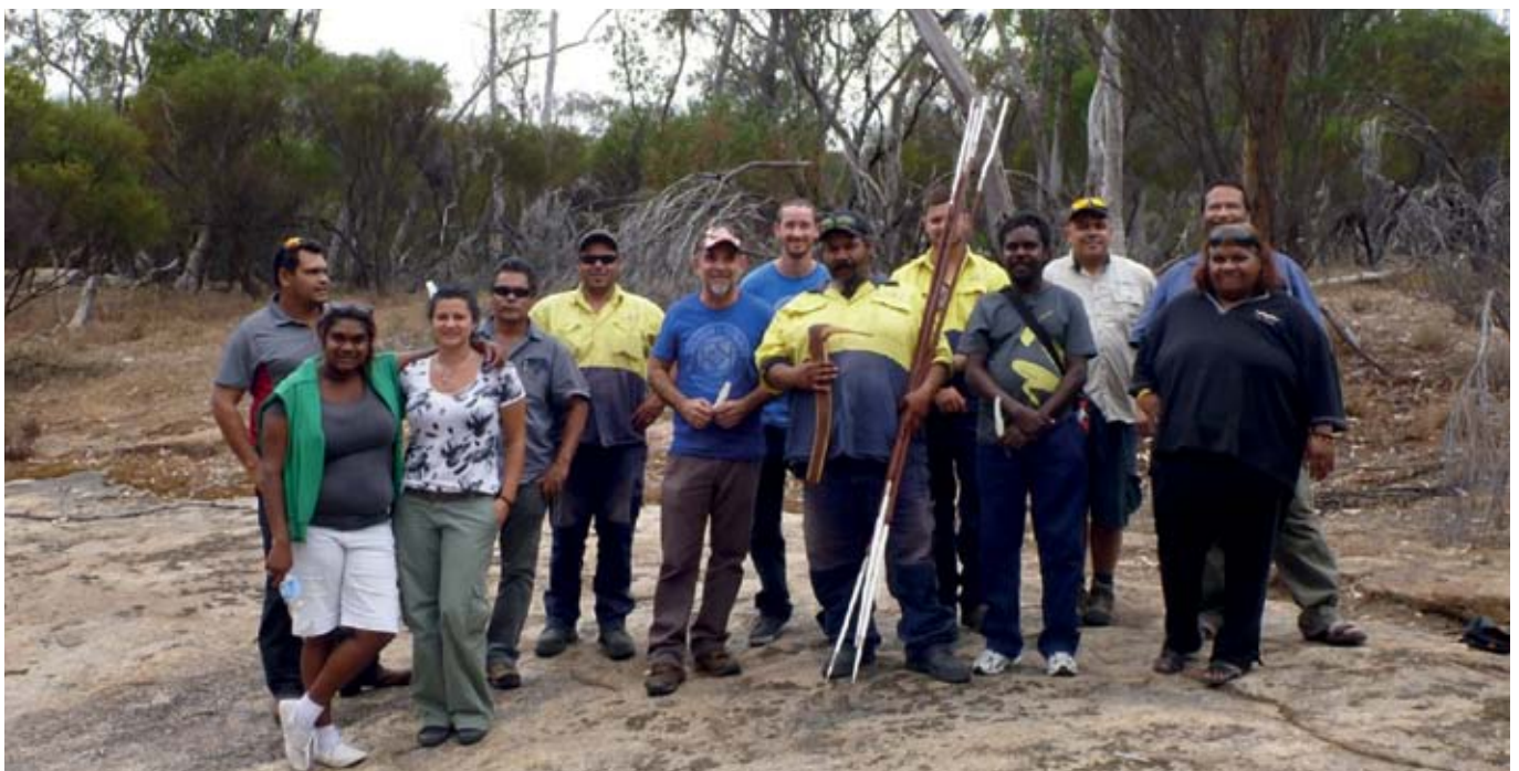
Dja Dja Wurrung traditional custodians of the Bendigo area with Central Australian and Arnhem Land recipients of the Ecological Society of Australia's Indigenous Travel Awards